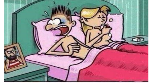
Oh relax silly, thats not my husband. That's me before the operation.

AS I WAS GETTING INTO BED, SHE SAID, "YOU'RE DRUNK." I SAID, "HOW DO YOU KNOW?" SHE SAID, "BECAUSE YOU LIVE NEXT DOOR!"